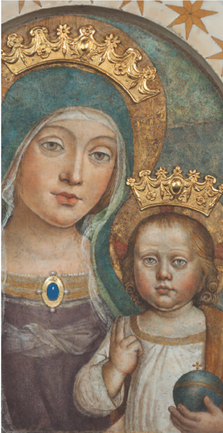
The ancient fresco of Madonna del Soccorso (Our Lady of Help) in St. Peter's Basilica was restored with the support of the Knights of Columbus to mark the Year of Faith (2012-2013).

O Mary, you always brighten our path as a sign of salvation and of hope. We entrust ourselves to you, Health of the Sick, who, at the Cross, took part in Jesus' pain while remaining steadfast in faith.