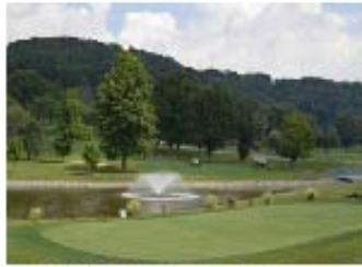
The Club at Shadow Lakes 2000 Beaver Lakes Blvd. Aliquippa, PA 15001

Pennsylvania State Council Knights of Columbus 40th Annual Golf Tournament Hosted by St. Joseph the Worker Council 5947 17-Aug-19 Registration 7:00 am Shotgun Start 8:30 am