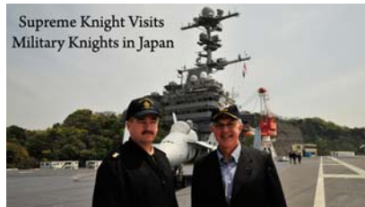
Supreme Knight Visits Military Knights in Japan

Among the more than 14,000 Knights of Columbus councils around the world, several are on U.S. military bases. Supreme Knight Carl Anderson paid a recent visit to U.S. Military Knights in Japan, touring the USS George Washington (aircraft carrier) in Yokosuka, leading a pilgrimage to Our Lady of Mount Fuji Shrine, installing the District Deputy for Far Eastern Military District No. 2, and attending a banquet with K of C members at the U.S. Army base at Camp Zama.